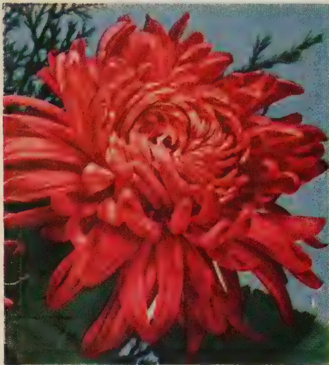
ALEX CUMMING. $1.00 each; 3 for $2.50